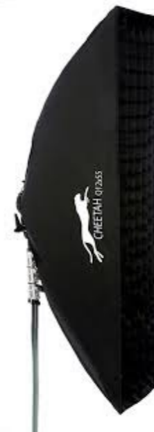
Cheetah 12"x55" Quick Strip Box

My go to Octa. Produces gorgeous flattering light for executive portraits and headshots. Sets up and breaks down in seconds with a unique umbrella design.