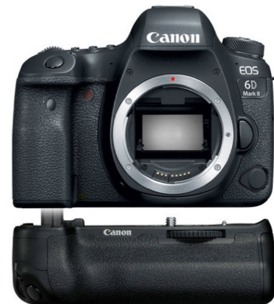
EOS 6D Mark II

30MP, 7fps, CF & SD card slots, builtin GPS and Wi-Fi. If you are photographing events too, go for this instead of the 6D.