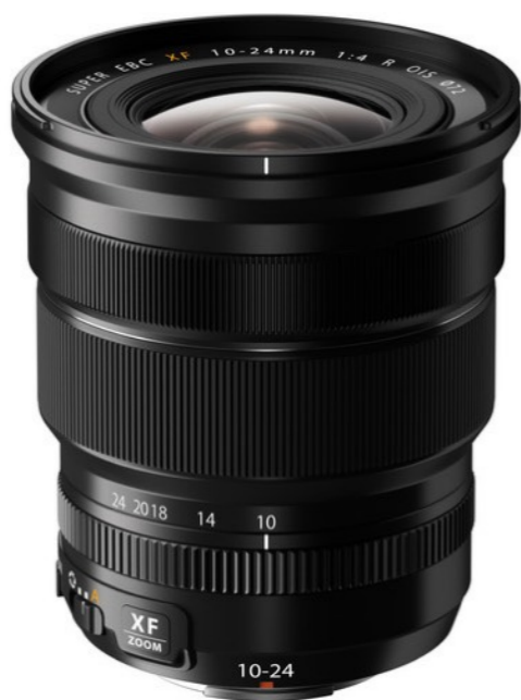
FUJIFILM 10-24mm XF f/4 R OIS

24.3MP APS-C X-Trans CMOS III Sensor, Built- In Wi-Fi Connectivity, Weather-Sealed Body; Two UHS-II SD Slots, Up to 8 fps Shooting and ISO 51200.