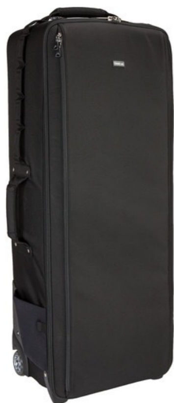
Production Manager 40

Lightweight & low profile width. With a front laptop pocket.