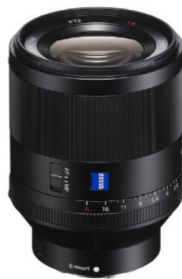
50mm f/1.4 ZA Lens

A razor sharp all purpose zoom. with a minimum focusing distance of 1.24 ft. and wonderful bokeh at f/2.8