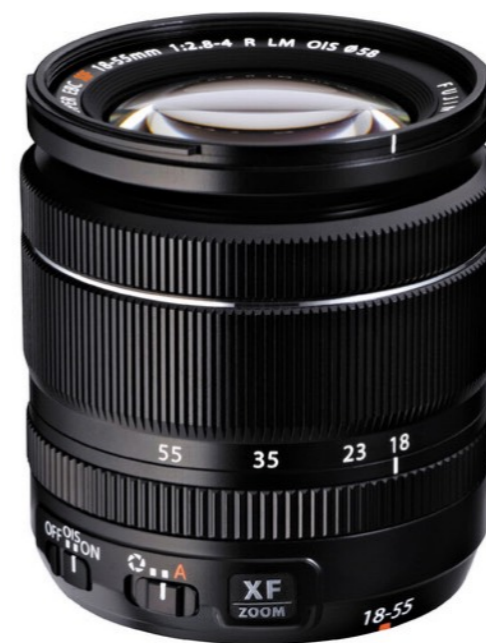
FUJIFILM 15-55mm XF f/2.8-4 R LM OIS

15-36mm / 35mm Equivalent, Optical Image Stabilization, Macro Focusing to 9.4"