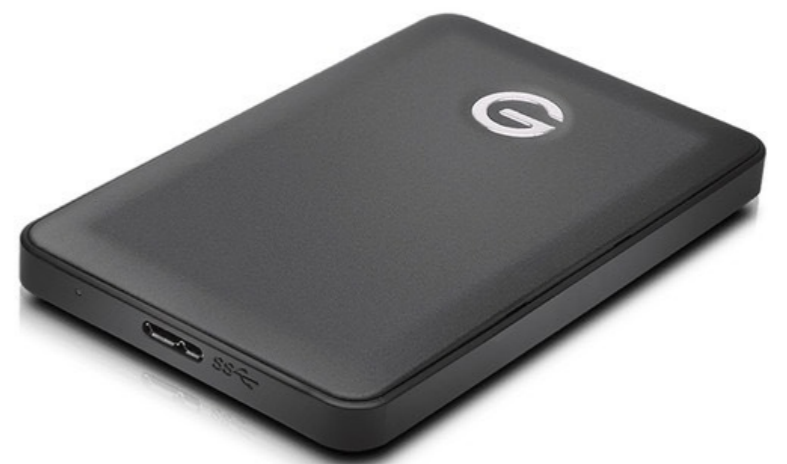
G-Tech Portable Drive