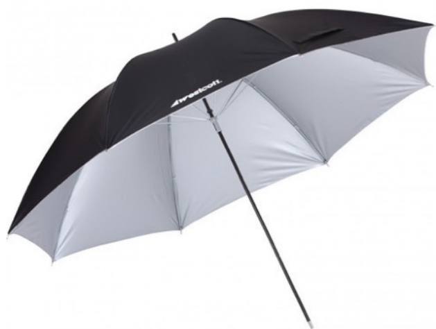
Westcott Apollo Deep 43" umbrellas

Sets up in seconds. Unique umbrella style design. Comes with egg create grid.