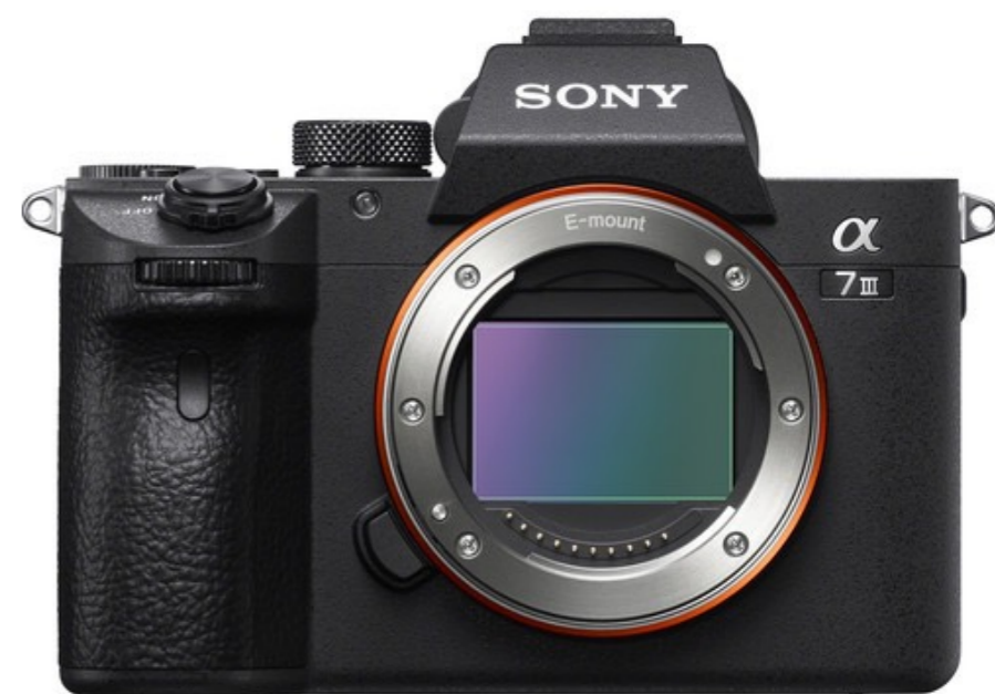
Sony a7 III

The camera body is used on all my shoots. 24mp, 20fps.