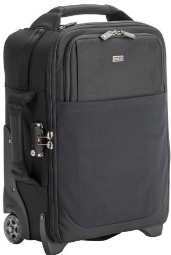
Airport International V3.0

Buller proof rolling bag. Keeps a beating and stays looking new.