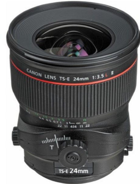
Canon TS-E 24mm f3.5 L Tilt- Shift Lens

Used sparingly on residential interiors, pressed into use for commercial interiors and used mostly for residential and commercial exteriors. Full manual focusing lens.