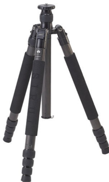
Sirui N-3204X Carbon Fiber

Weighing only 1lb. This is the lightest tripod I've found for walkabouts when traveling.