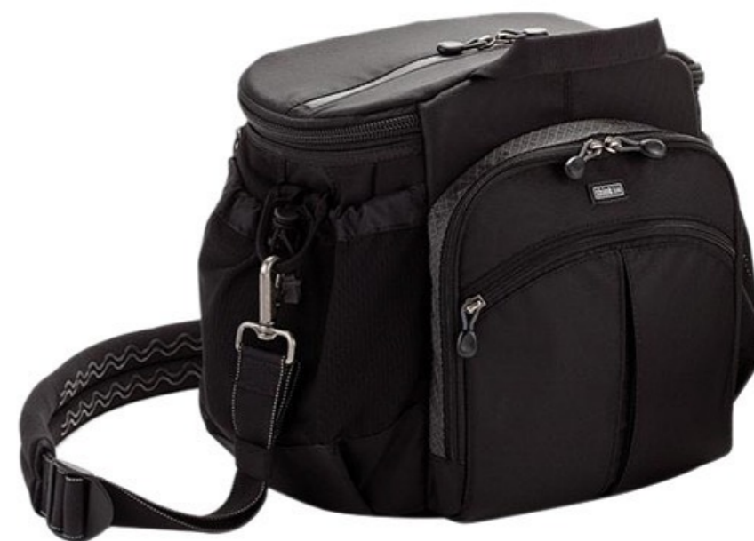
Speed Racer V2.0

Perfect for holding 4 Sony camera batteries.