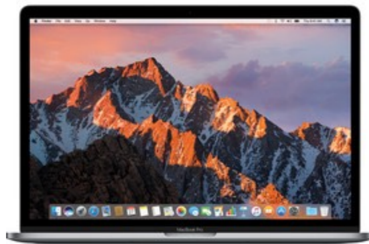
MacBook Pro 15" Touch Bar

4.2 GHz Intel Core i7 Quad-Core, 8GB of DDR4 RAM | 1TB SSD, Thunderbolt 3 | USB 3.0 Type-A, 1 x Gigabit Ethernet Port