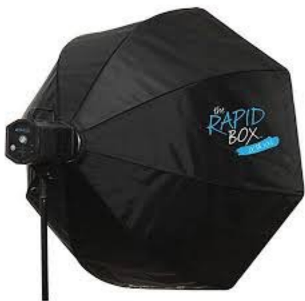
Westcott 48" Octa XXL, Rapid Box

My go to Octa. Produces gorgeous flattering light for executive portraits and headshots. Sets up and breaks down in seconds with a unique umbrella design.