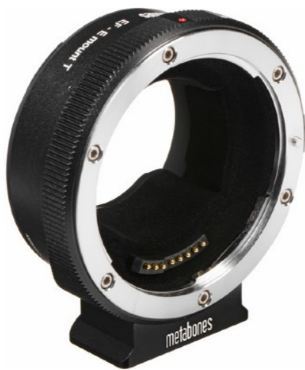
Metabones IV Adapter

My number one, go to lens, for the majority of my interior photo shoots. Fully manual focusing lens.