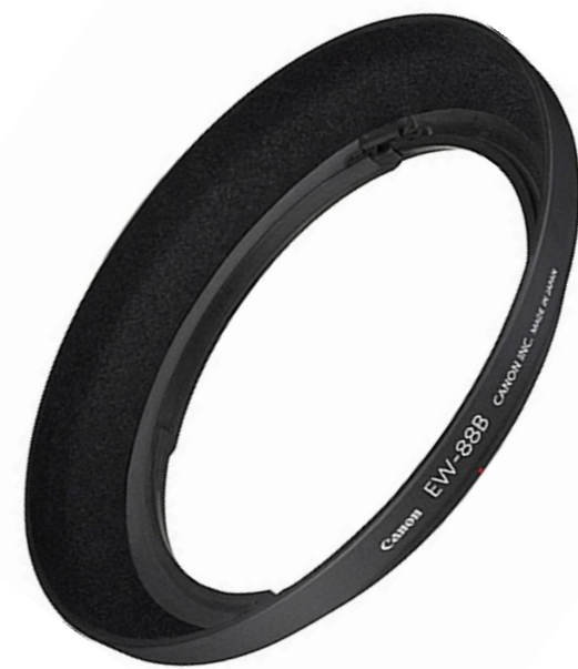
Canon EW-88B Lens Hood

I own two, both attached to my Tilt-Shift lenses for adaptation to my Sony cameras. This item has been discontinued. You can get the Sigma MC-11 or the Metabones V both excellent replacements