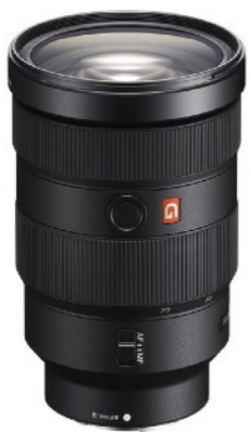
24-70mm f/2.8 GM Lens

A razor sharp all purpose zoom. with a minimum focusing distance of 1.24 ft. and wonderful bokeh at f/2.8