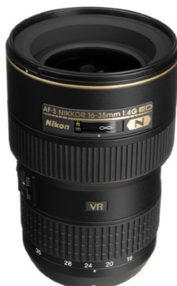
NIKKOR 16-35mm f/4G ED VR

AF-S NIKKOR 14-24mm f/2.8 G ED. Silent Wave Motor AF System.