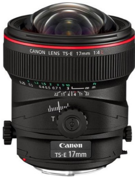
Canon TS-E 17mm f4 L Tilt- Shift Lens

Used sparingly on residential interiors, pressed into use for commercial interiors and used mostly for residential and commercial exteriors. Full manual focusing lens.