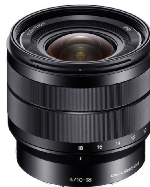
Sony 10-18mm f/4 OSS

A great budget, manually focusing lens with an equivalent of 18mm with the 1.5x cropped factor on an APS-C camera body.