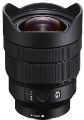
12-24mm f/4 G

A wonderful detail lens tack sharp wide open. Has a unique cloth system on the barrel that allows you to quickly switch to manual focus.