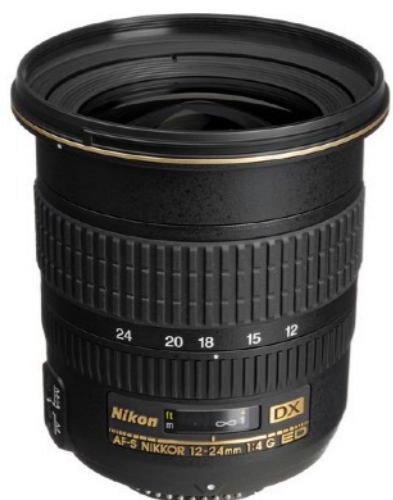
NIKKOR 14-24mm f/2.8G ED

24.3MP, dual card slots, built-In Wi-Fi. Native 12800, Extended to ISO 51200.