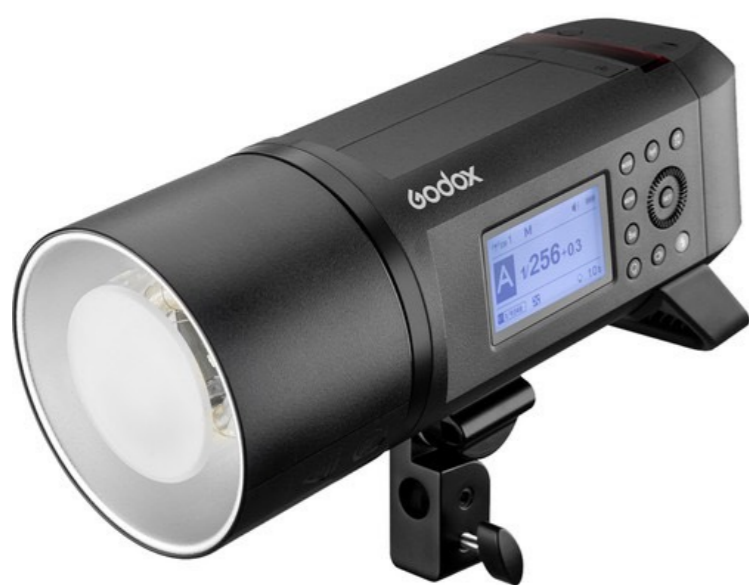
Godox AD600 PRO

Built in radio receiver, Li-Ion battery that outlasts any Energizer bunny. Packs the power of 3 Speedlights. TTL, HSS and Manual