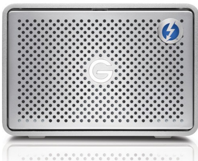
G-Tech 8Tb Raid Thunderbolt

I've been using G-Tech drives for over a decade and have never had one fail.