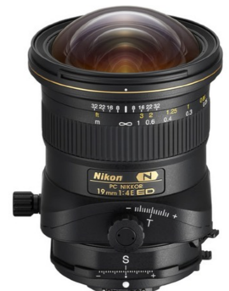
19mm Tilt Shift

AF-S NIKKOR 16-35mm f/4G ED VR. VR II Image Stabilization, Silent Wave Motor AF System.