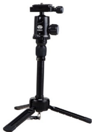
Sirui 3T-35K Table Top Tripod

Sirui Tripods: Siuri {Soo-Ray} makes beautifully crafted carbon fiber tripods. Their pricing is easily 30% below leading manufacturers like Manfrotto and Gitzo. All their tripods come with an industry leading 6 year warranty.