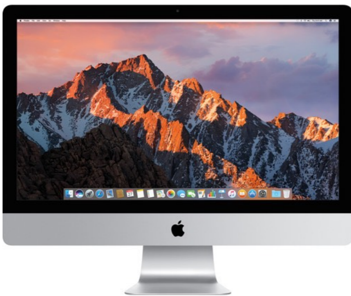
iMac i7 27" Desktop

4.2 GHz Intel Core i7 Quad-Core, 8GB of DDR4 RAM | 1TB SSD, Thunderbolt 3 | USB 3.0 Type-A, 1 x Gigabit Ethernet Port