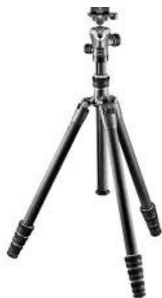
Sirui T-25SK T-0S Travel Tripod

Arca-Swiss D4, classic knob quick release. The Bugatti of geared heads. A lightweight, precision geared, head.