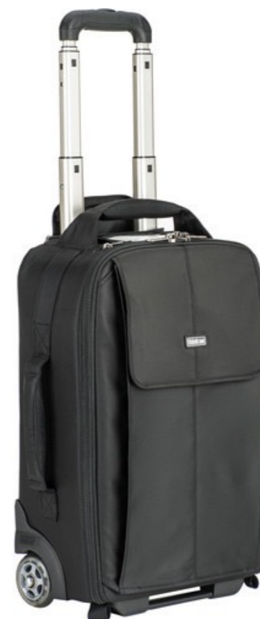
Airpot Advantage Roller

One of my favorite rollers. Easily half the size and weight of the International but still fits what's needs for a small shoot.