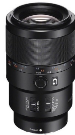
90mm f/2.8 Macro G OSS

My go to lens for headshots and executive portraits. Has an aperture ring on the barrel making it a great Cine lens.