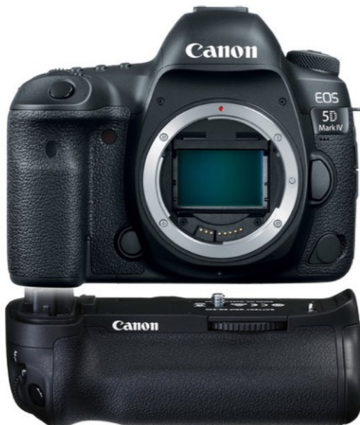
EOS 5D Mark IV

30MP, 7fps, CF & SD card slots, builtin GPS and Wi-Fi. If you are photographing events too, go for this instead of the 6D.