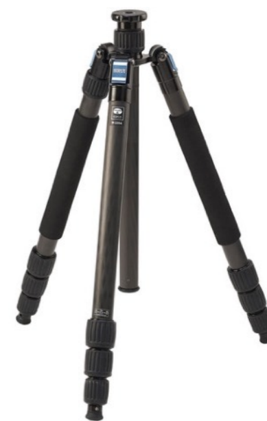
Sirui W-2204 Carbon Fiber

My back up tripod. Always have a back up in your car trunk.