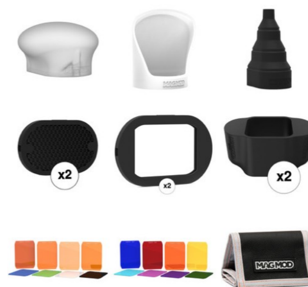
MagMod Flash Kit

I often use bounce umbrellas for interior photoshoots when there are no white walls to bounce my lights off of.