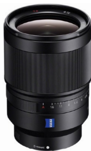
Distagon T* FE 35mm f/1.4 ZA

My go to super wide. Minimal barrel distortion that is fully correctable in Adobe LR.