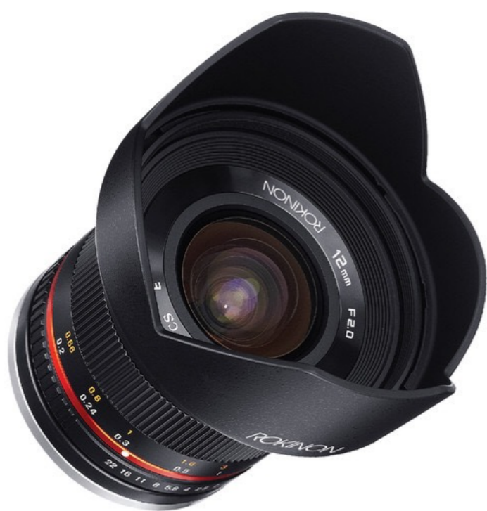
Rokinon 12mm f/2.0 NCS CS

24.2MP, built in EVF, 11 fps. Built in 5 Axis stabilization. Can easily double as an event camera or executive portrait camera. Amazing focus tracking.