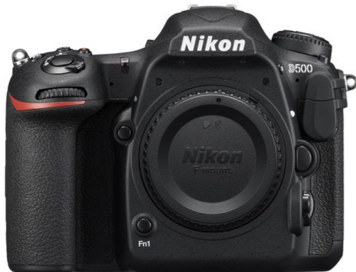
Nikon D500 DSLR

26MP, dual card slots, built-In GPS and Wi-Fi. Native 51200, Extended to ISO 1640000. If you also photograph events go for this one.