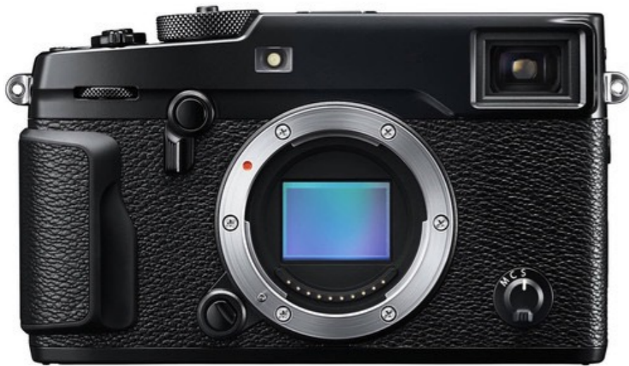
FUJI XPRO 2

24.3MP APS-C X-Trans CMOS III Sensor, Advanced Hybrid Multi Viewfinder, Built-In Wi-Fi, 273-Point AF with 77 Phase-Detect Points, Up to 8 fps shooting and ISO 51200.