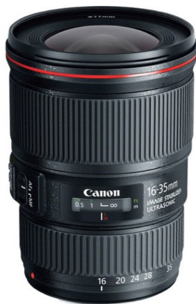
EF 16-35mm f/4L IS USM

26MP, singl slots builtin GPS and Wi-Fi.