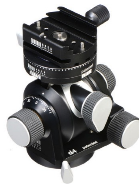
Arca-Swiss D4 Geared Head

Sirui's most robust, and super stable carbon fiber tripod. I use it for all my architectural shoots.