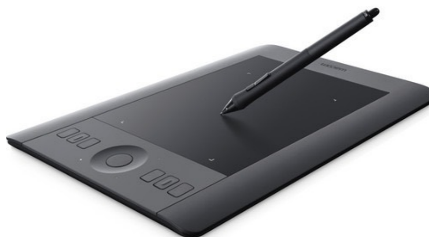
Wacom Intuos Pro Small

I've been using G-Tech drives for over a decade and have never had one fail.