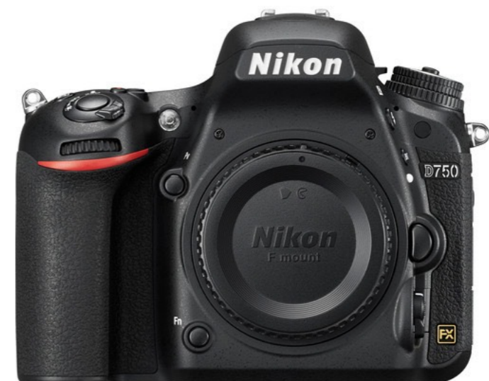
Nikon D750 DSLR

26MP, dual card slots, built-In GPS and Wi-Fi. Native 51200, Extended to ISO 1640000. If you also photograph events go for this one.