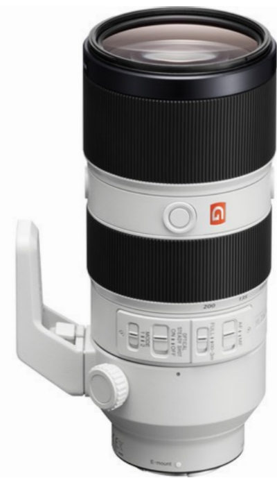
70-200mm f/2.8 GM OSS

Tack sharp wide open and stopped down. Like the 1.4/50mm, the 35mm has an aperture ring on the barrel making it a no brainer for filming video.