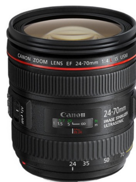
EF 24-70mm f/4L IS USM

Save some money by buying this f/4 lens instead of the f/2.8. When photographing real estate you won't be needing f/2.8 lenses for interiors.